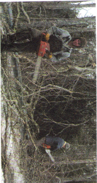
Ice storm cleanup in Crossville, Tennessee.

The purpose of Rapid Response is to demonstrate our faith in Christ by reaching out to survivors of natural disasters. As people observe the lives and actions of Rapid Response volunteers, we want them to see Jesus. Since we profess to know and love Jesus, our daily lives should demonstrate that. As Christians, we have a responsibility to show the world a faith that works (James 2:20).