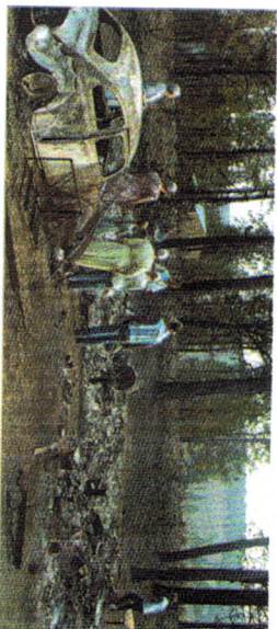
Forest fire damage in Sprague River, Oregon.