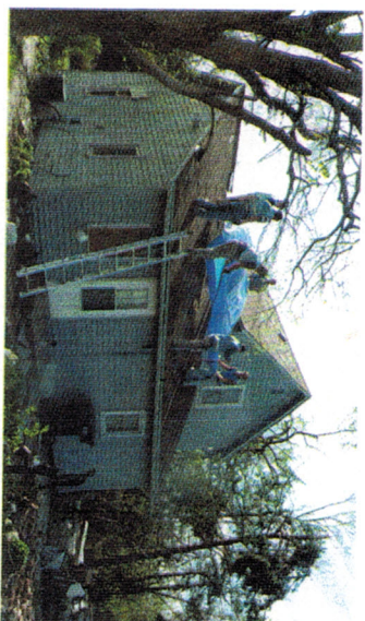
Tornado cleanup in Beaver Crossing, Nebraska.