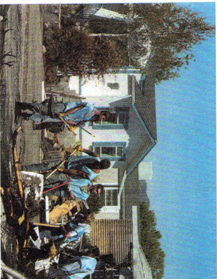
Earthquake cleanup in Napa Valley, California.

Your team worked tirelessly like the locusts in Exodus 10:12-19, cleaning everything in their path. A blessing we don't get to see very often these days. Proof that God is still at work. —TN